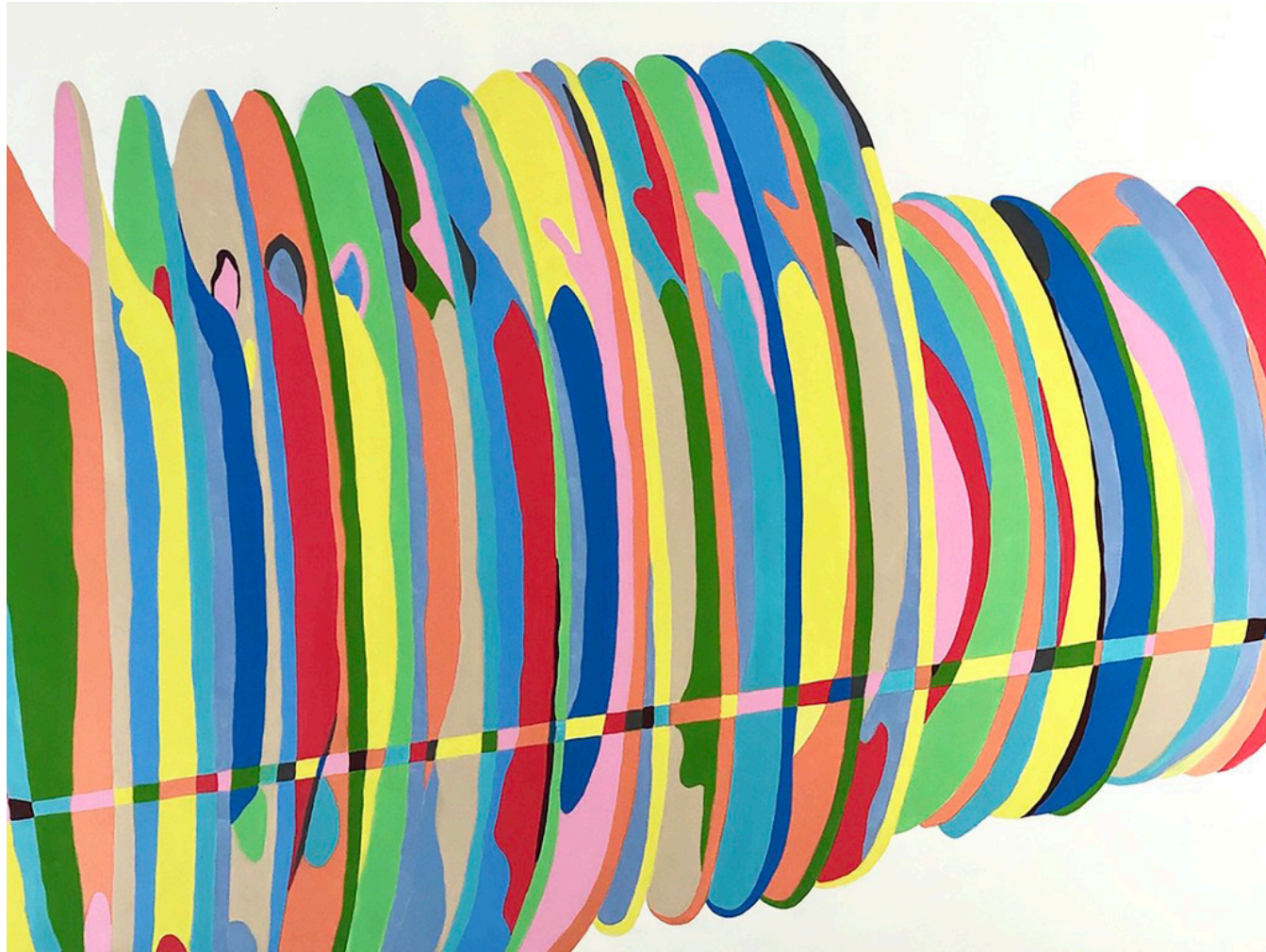
Patti Samper Dishrack , 2021, Oil on wood panel, 18" x 24"